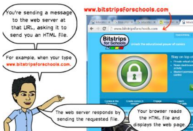
Figure 3: Examples of students' submitted digital educational comics.

In the digital educational comics, participants presented their understanding on selected topics (e.g. server-side script and client-side script) in web programming subject. Based on what they have learned so far in official lecture and lab sessions, the participants may refer to additional books and online resources to help them reflecting and organizing their overall idea about the topic. As reported by Engler, Hoskins, and Payne [39], since students were unable to complete their digital educational comics within the remaining class time, the composing process using BitStrips for School were preceded as home assignment.