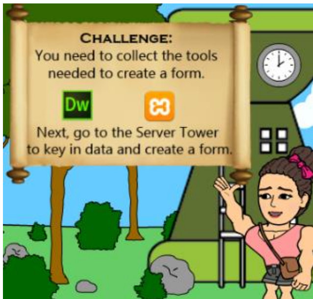
Figure 2: Examples of students' submitted digital educational comics

In the digital educational comics, participants presented their understanding on selected topics (e.g. server-side script and client-side script) in web programming subject. Based on what they have learned so far in official lecture and lab sessions, the participants may refer to additional books and online resources to help them reflecting and organizing their overall idea about the topic. As reported by Engler, Hoskins, and Payne [39], since students were unable to complete their digital educational comics within the remaining class time, the composing process using BitStrips for School were preceded as home assignment.