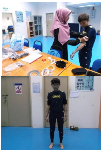
Figure 3. Subject preparation

In the subject preparation, it is vital to ensure that the subject has worn the proper MoCap suit. This is to ensure that the markers can be placed on the MoCap suit. The subject is recommended to wear a tight suit instead of a loose suit. The placement of the markers are essential in capturing the movement, and they are required to be attached correctly to the bodysuit relative to the bones of the subject in order to capture a much better motion data. For the VT 2 E prototype, 20mm and 25mm diameter markers were used for capturing a full body human movement. According to [27], while capturing the motion data, it is important for each marker to be captured by at least three cameras simultaneously to ensure that the object to be produced in the form of a 3D representation. In the VT 2 E prototype, altogether 43 markers were placed on the subject. Figure 3 shows the subject preparation process where the markers were attached to the MoCap suit.