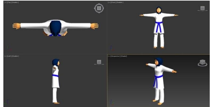
Figure 7. A female taekwondo characters

For the VT 2 E prototype, a female human character was developed as shown in Figure 7. The character wears the V-neck uniform with a blue belt. The modelling of the character involves several phases; namely head, torso, leg, arm, hand and clothes modelling.