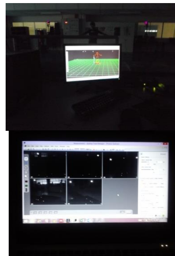
Figure 4. Calibration process

In ensuring that the subject's movements were to be captured entirely, another calibration process is required. The subject is required to do the "T" position, scaling position, and range of motion. Figure 4 shows the calibration process for the "T" position of the subject. In this case, the subject has to do a simple movement like walking to ensure the MoCap system could track the markers on the subject. If there were some missing and uncompleted data, the MoCap process must restart with the capturing of the "T" position, scaling position, and range of motion again. In this stage, all the markers were identified and labelled.