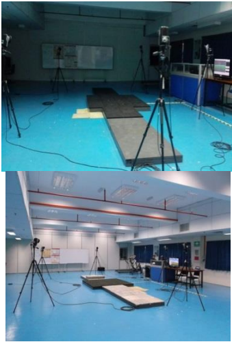
Figure 2. System preparation

to be produced. The hardware for this system mainly comprised of computers with Windows 7 (64-bit and 32-bit) and XP Professional (32-bit). The QTM was used to capture and collect any data through the MoCap system, and it can generate data in the form of 2D, 3D and 6 Degree of freedom (DOF) in real time with minimal latency.