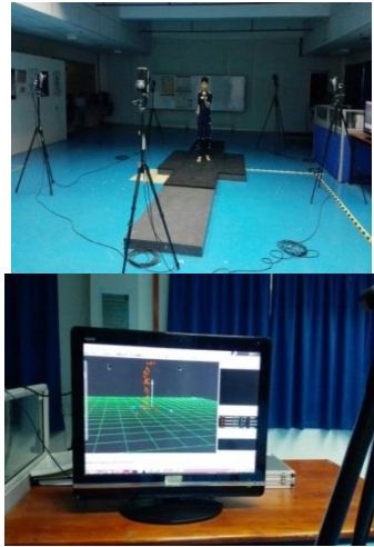
Figure 5. Capture session