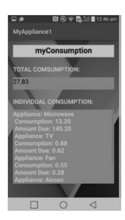
Figure 3. Screenshot of the myConsumption activity in the android app

assigned socket module, thus turning off the socket module, blocking access to the appliance.