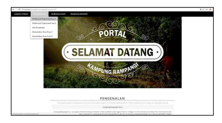
Figure 3: Main interface of web portal of Kampung Rampangi Phase I & II

In line with that, Kampung Rampangi Phase I and II have started their community profiling a few years ago, by using a conventional approach, which is paper-based. Drawbacks of the approach were paper wasted as the number of population keep increasing over the years, difficulty to update new information in the paper-based record and improper data management when manually searching for the individual villager.