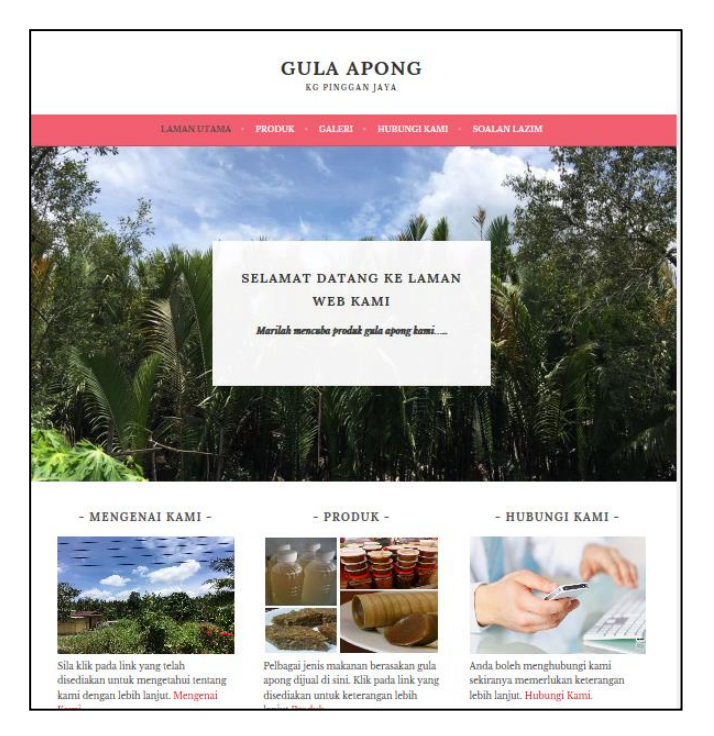
Figure 5: Main homepage of Kampung Pinggan Jaya website

The SL students, therefore, has designed and developed an interactive website to assist the community in promoting and marketing their local product and specialities via online. Figure 5 depicts a main homepage of the interactive website. One of the main feature on the website is a video showing the gula apong manufacturing process with a purpose to share the information to the worldwide. Ultimately, it is hoped that the website could benefit the community in promoting and marketing their gula apong to the globe via online.