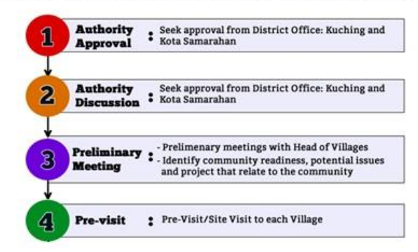
Figure 6: Four steps of Community-Faculty Engagement for Village Community

Firstly, faculty seeks approval from District office in Kuching and Kota Samarahan. Once faculty got the approval, it was followed by discussions with District Officers to seek their advices, recommendation of villages as well as concerns and issues in the villages. To achieve the objective of preliminary engagement process, faculty adopted a top-down approach (from step 1-2) to identify recommendations from higher authority, District Office on list of villages to the community in Kuching and Kota Samarahan.