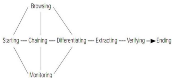
Figure 1: Ellis's model

Ellis's information-seeking behaviour model contains eight elements of process or features. They are starting, chaining, browsing, differentiating, monitoring, extracting, verifying and ending [13].