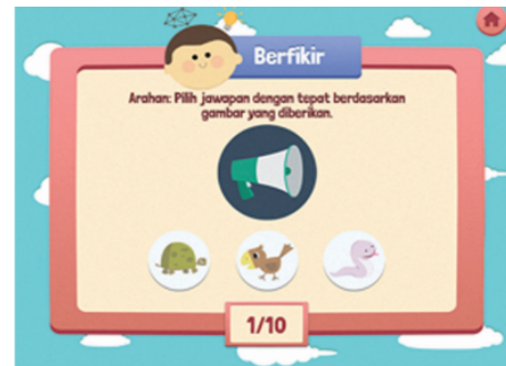
Figure 3: “Berfikir” module

Figure 2 shows the screenshot for “Menyusun” module. In this module, user needs to arrange the numbers in ascending and descending trend. User must select the answer from options provided by click on it.