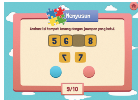
Figure 2: “Menyusun” module

Figure 1 shows a screenshot for the main menu of i-Dyslex tool. The main menu displays the entire menu for each module available in this tool. The user can click on any module to begin the screening test and the application will display the module. Each of the module have 10 questions and total of question in this tool are 50.