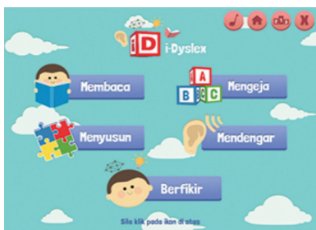
Figure 1: Main menu of i-Dyslex tool

i-Dyslex tool is a computer based and stand-alone application. It consists of five modules which are “Mendengar”, “Membaca”, “Berfikir”, “Mengeja” dan “Menyusun”. Malay Language was used as a main language in this tool in order to avoid misinterpretation of the questions. Sample screenshots of the tool are shown in Figure 1 to 3.