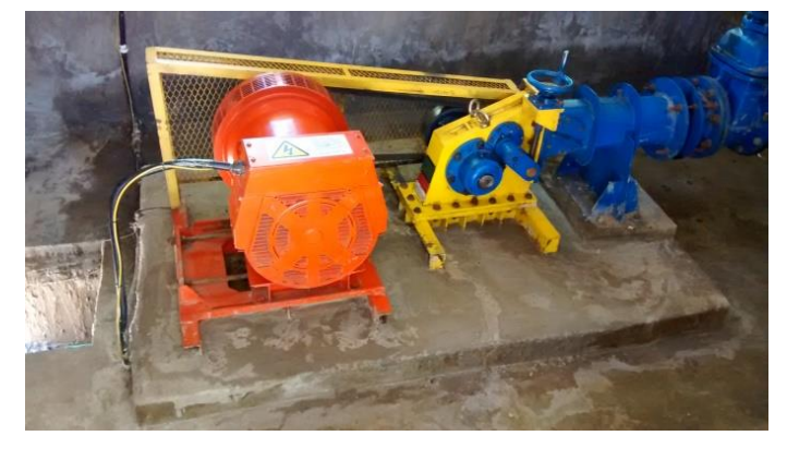
Figure 4: A micro-HEP turbine (blue, yellow) and generator (orange) located in Bario, Sarawak.

An attempt was made to collect data from all the failed solar projects of the LEA but they apparently do not keep records of