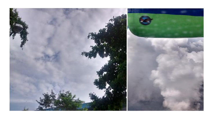
Figure 1: Above is view of clouds over Sarawak from ground level on a typical morning. On right is a picture of clouds taken from a plane which depicts the vertical height of clouds

The heavy rains result in the five factors listed in the next five paragraphs below which indicate that tapping solar power is not conducive to equatorial Sarawak.